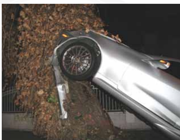
Mercedes ran up sidewalk and up tree. Slant of tree allowed car to climb the tree trunk, gradually slowing vehicle, resulting in no injuries.

time an allegation of any injury is made, in the case of hit and run, where city liability/ property is involved (CPI), and in cases impacts). involving 12500 VC (driving without a license). Make sure the cover sheet that you carry is current (2006 — older than 2003 is not usable). Check all parties for injuries FI cards." and get RAs en route if needed. Next, get